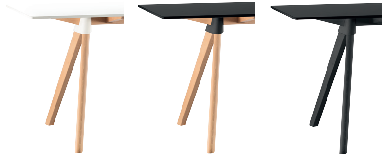
Frame: Natural beech Joint: White 1735 C Top: White 8500